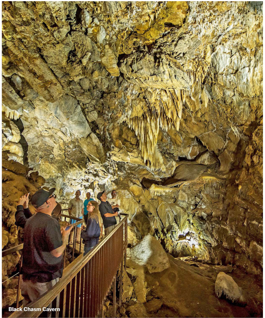
Black Chasm Cavern

Dive into 19th-century Gold Rush history along Highway 49 at Kennedy Gold Mine and the Amador County Museum near Jackson . But even the gleam of gold can't compare to nature's million-year-old rock sculptures revealed in tours through Black Chasm Cavern in the hills above Volcano off of Highway 88. This National Natural Landmark includes trails, picnic areas, a sluice-gold-panning activity, and even a monolith-filled Zen Garden. But the real treasure worth the trip is what lies hidden below at your final destination.