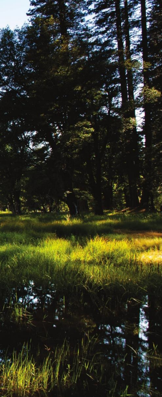
Left: A calm reflection of the Cathedral Spires as seen from the valley floor in Yosemite Valley in Yosemite National Park.